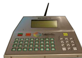
Wireless Tabletop Controller (WTTTC-1)