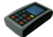
Wireless Handheld Controller (WHC-1)