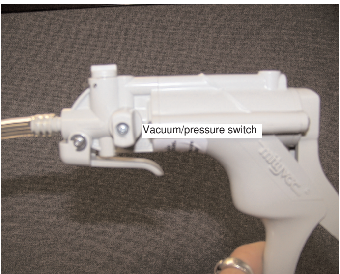
Figure 4: Vacuum and pressure ports