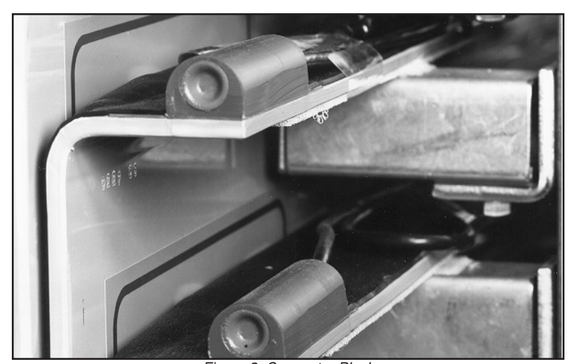
Figure 2: Connector Block