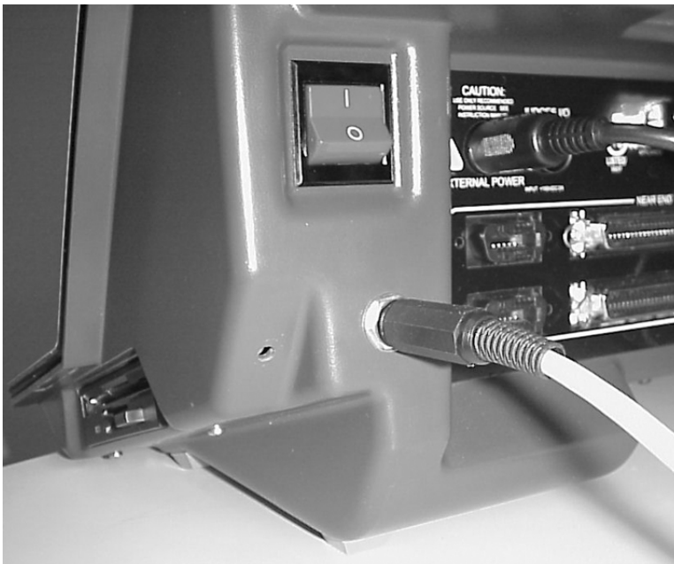
The scoreboard and power jacks on the back of the System 6

Connect the DIN connector from the 15-volt power supply that came with your System 6 to the external power connector on the back of the System 6, and plug the adapter into a working AC outlet. Use only the recommended power supply! Use of any other power supply (including a System 5 power supply) may cause serious damage to your system.