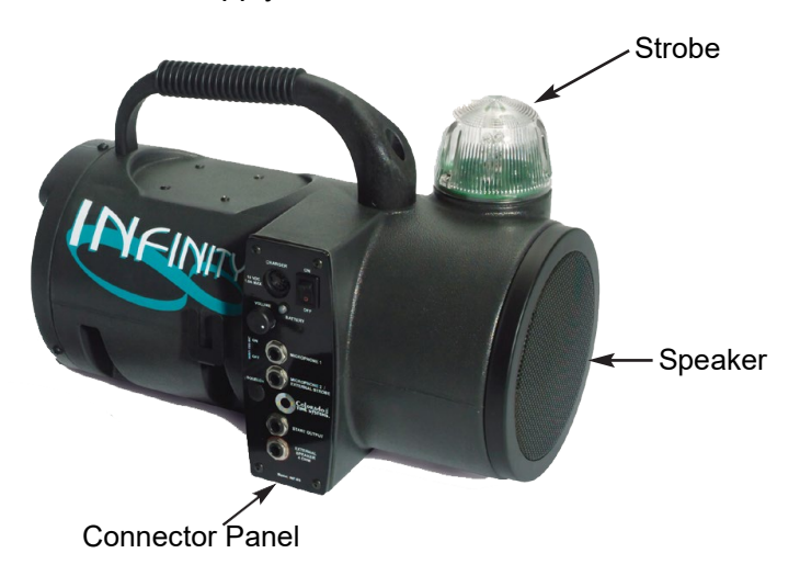
Figure A: Infinity Start System Components

System. When servicing those parts shown in the user manual, use only replacement parts specified. Replacing of fuses or similar servicing shall be performed only while the unit is disconnected from the source of supply.