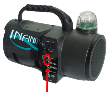
Mic 1 and Mic 2

• Plug the 1/4" jack from the microphone cable into the microphone input of the start system.